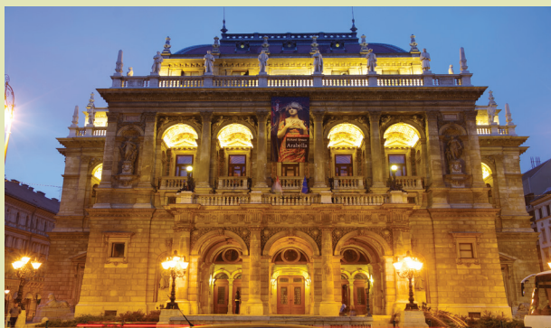
Budapest Opera House