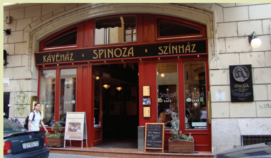
Spinoza café, theater and restaurant in the old Jewish Quarter

Follow in the footsteps of more than 2,500 undergraduates who have taken advantage of Budapest Semesters in Mathematics (BSM), the preeminent study abroad program in mathematics. Founded in 1985 by friends of Paul Erdős, the program encourages student creativity, a key element in the highly successful Hungarian method of mathematics instruction.