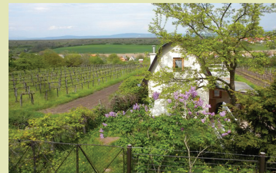
Rural landscape on a countryside bike ride