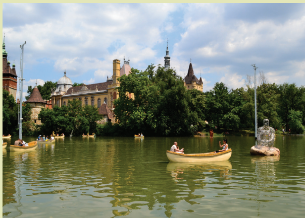
Budapest's City Park

Hungary is a small country, about the size of Indiana. A member of the European Union, Hungary developed its distinctive culture over a thousand-year history, blending influences from East and West. Budapest, the capital, a city of two million, displays a scenic combination of natural and architectural beauty on the banks of the Duna (Danube) River. Famous for its graceful bridges, green parks, vibrant culture, and delicious food, Budapest is a remarkably safe and pleasant place.